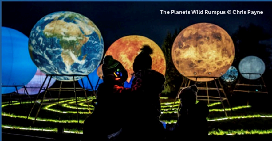
The Planets Wild Rumpus